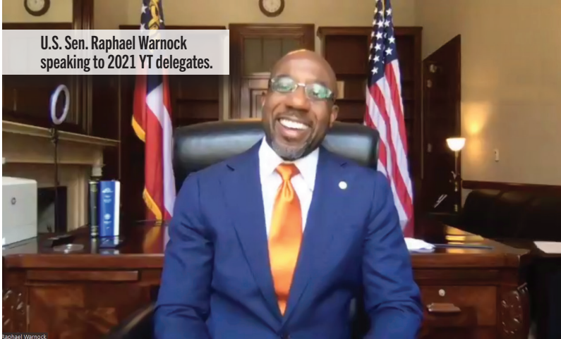
U.S. Sen. Raphael Warnock speaking to 2021 YT delegates.